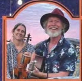
Barleyshakes Duo (AUS)