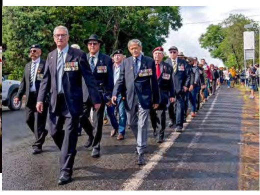
Above: Dawn Service Montville All other images Mapleton