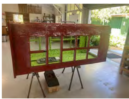
The second photo shows the telephone box freshly painted following replacement of rotted timberwork on the partly renovated project.