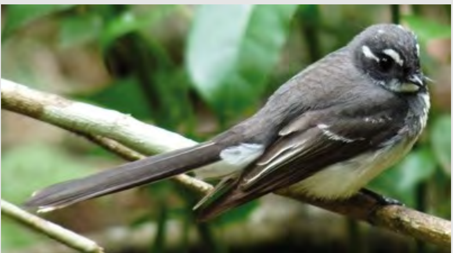
Another image of a grey fantail.

Observed in the forests of Mapleton. This species can be quite shy so being able to take an image from such a close quarter was such a thrill.